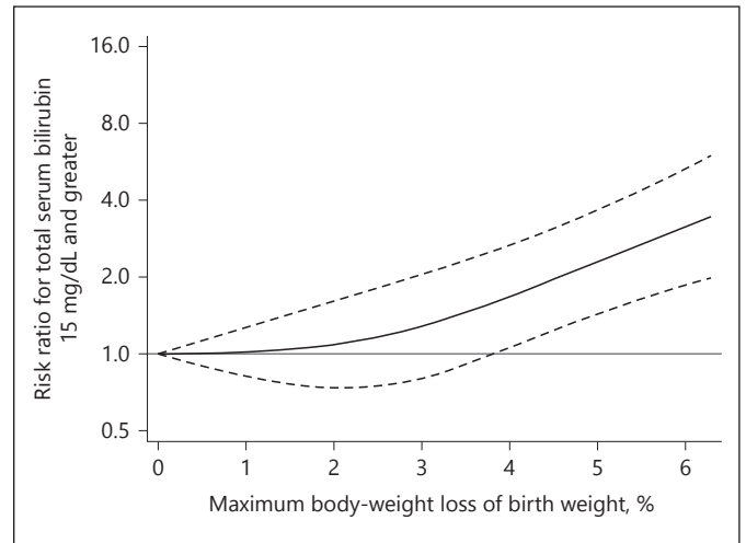
Fig. 3. Cubic spline curves showing the risk for total serum bilirubin levels \geq 15 mg/dL against body-weight loss. Risk ratios (solid line) and 95% CIs (dashed lines) were estimated by Poisson regression with robust variance, adjusted for sex, gestational age, birth weight, Apgar score, maternal age, maternal body mass index, and parity.

multivariable analysis, given that the magnitude of RR ranged from 0.02 to 0.12 in Table 3, we speculate that the combination method is a clue for emerging concern about body-weight loss leading to neonatal jaundice, as well as hypoglycemia and hypernatremia dehydration, among exclusively breastfed neonates [3, 6–15, 17]. Neonates exclusively breastfed without thermal control may not have the advantage of improved digestive function [3]. For example, (1) gastric emptying time was better in breastfed neonates with thermal control (<1 h) than breastfed neonates without thermal control (>1 h), (2) compared with average serum glucose levels during the first 8 h of birth in breastfed neonates without thermal control ( \sim 40 mg/dL) and breastfed neonates with thermal control only ( \sim 50 mg/dL), neonates with the combination method had higher levels (ranging from \sim 50 to 70 mg/dL), and (3) regarding the time required for serum level of free fatty acids to start decreasing, compared with breastfed neonates without thermal control (8 h of birth) and breastfed neonates with thermal control only (8 h of birth), neonates with the combination method appeared to start earlier (4 h of birth). In addition, exclusive breastfeeding may not always provide sufficient calorific intake to neonates according to basal maintenance expenditure [3]. This problem is illustrated by our observation of a lower incidence of jaundice in neonates born to multipara mothers com-